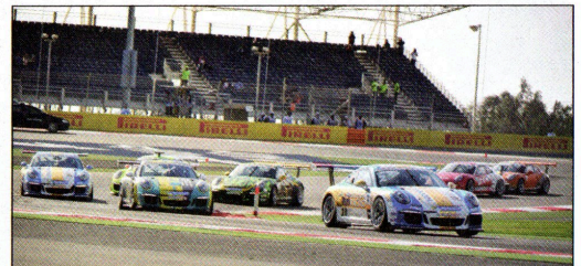
Action from the Porsche GT3 Cup race. Top, start of the TCR Series race