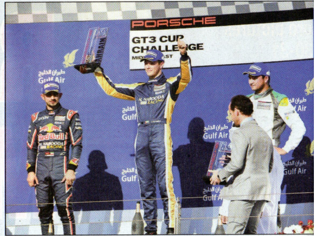
TCR Series and GT3 Cup, right, winners on the podium