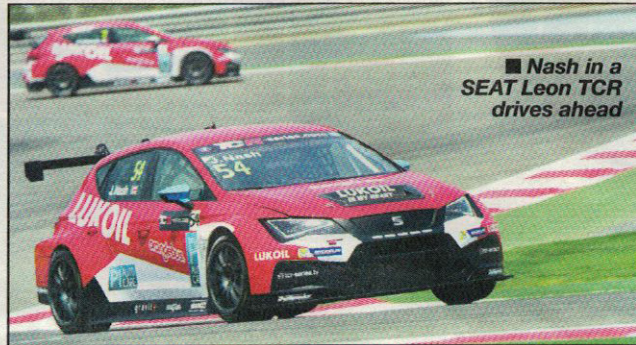
■ Nash in a SEAT Leon TCR drives ahead